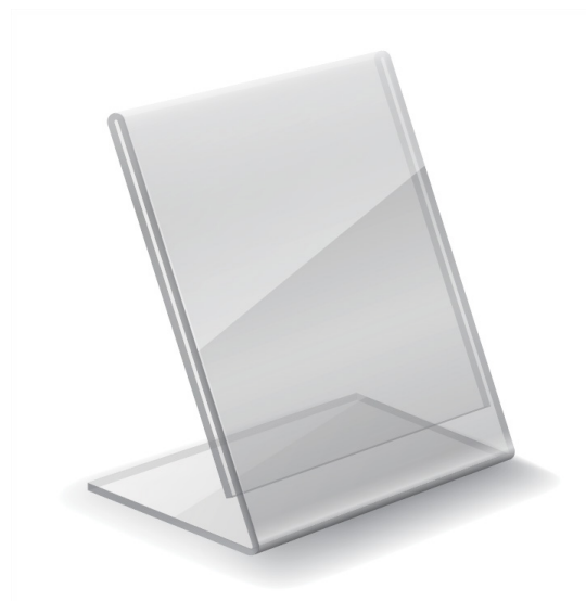
Small Ad - 5 x 7

Advanced formula contains a powerful copper complex, Hyaluronic Acid, and Niacinamide, to fight signs of aging and improve fine lines and wrinkles. This formula delivers equivalent results to one injection of collagen filler in just two weeks of use* by reactivating collagen and elastin synthesis.