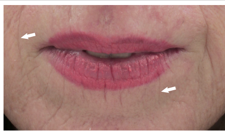
After - 60 Days